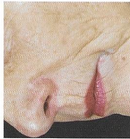
After Two Treatments