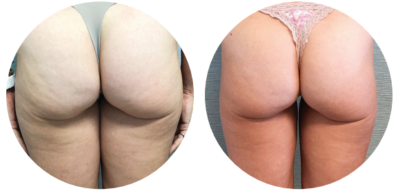
3 Treatments BEFORE AFTER